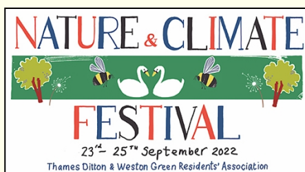
Initiated and organised TD & WG's first Nature & Climate Festival