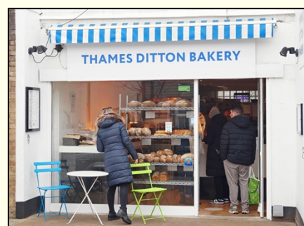
Saved our popular bakery from property conversion to residential use