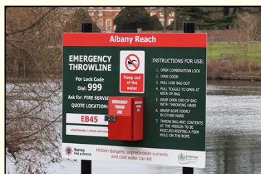
Responded to resident's appeal to provide emergency throwlines on popular Albany Reach