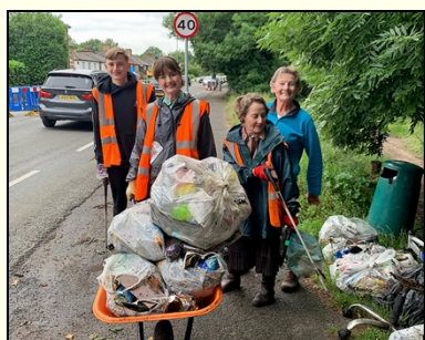
Set up the volunteer monthly litter-picking groups in TD+WG