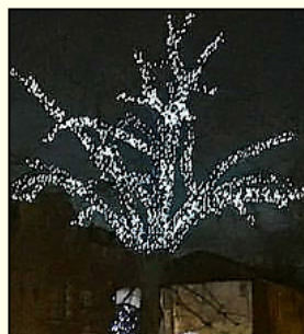
Installing & regularly maintaining Christmas tree lights in the High Street