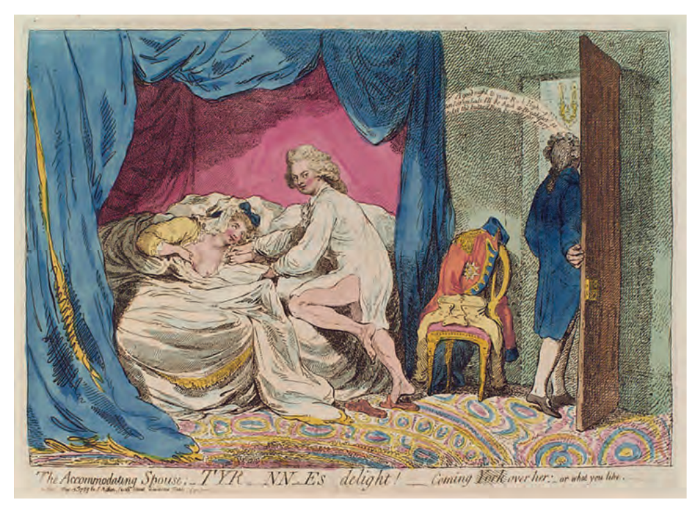
The Accommodating Spouse, by James Gillray, 1789 (as Tyrconnel leaves, the Duke of York disrobes)

who was brought up by Gloucester's steward on a farm at Hampton Court. Encouraged by the King to stay out of the limelight, the Duke and Duchess and Lady Almeria travelled much in Europe between 1783 and 1787. We have a vignette laced with bonking innuendo in the European Magazine and London Review, for December 1783: