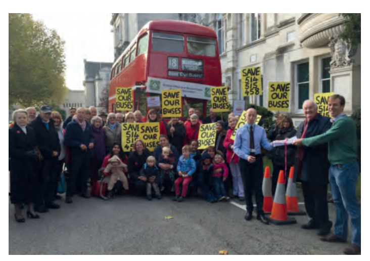
'Save our buses' petition arriving at County Hall