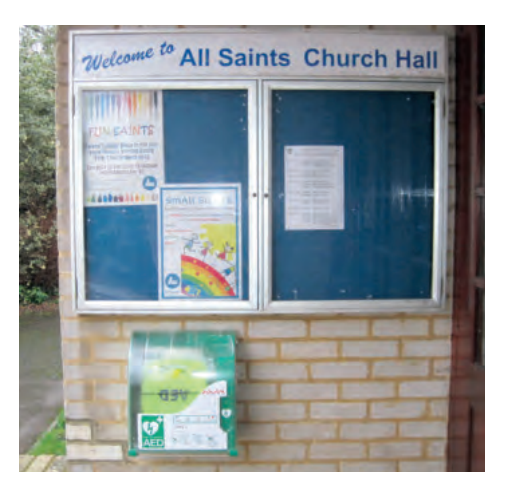
Life-saving equipment at Weston Green Church Hall

In February All Saints Weston Green hosted three sessions of first aid training for volunteers at the Church and members of the local community to coincide with the installation of the new Automated External Defibrillator which is located by the door of the Church Hall at All Saints.