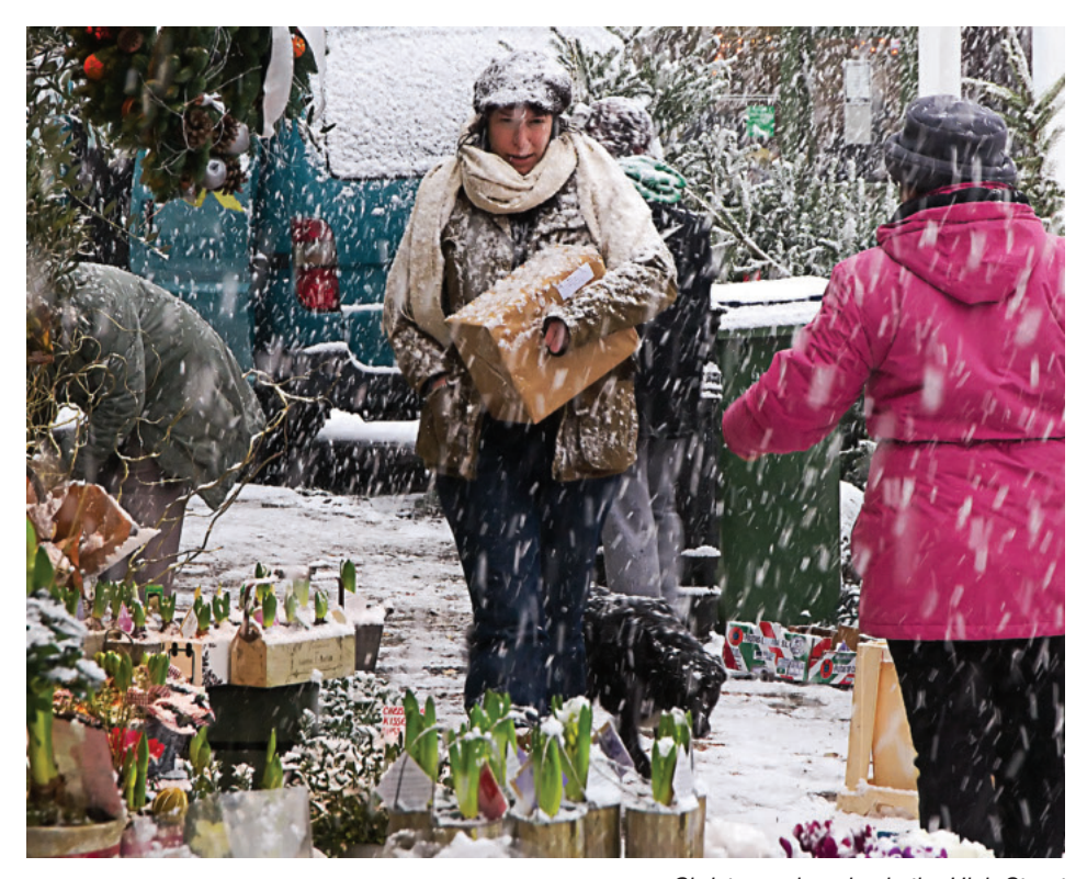
Christmas shopping in the High Street