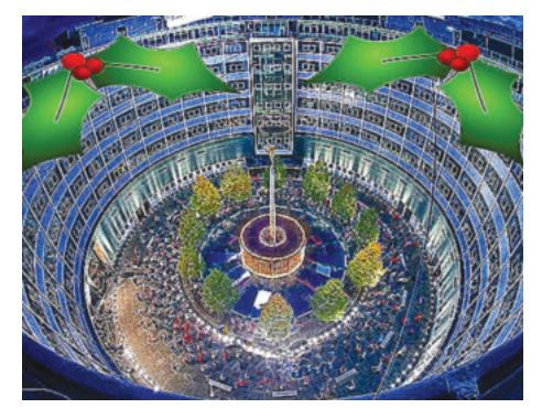
Television Centre - the oracle

'May' may stem from Maiesta, the Roman goddess of reverence and majesty.