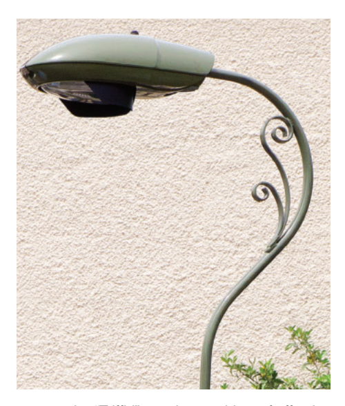
the "Triffid" may be an object of affection in 30 years time...

Outside the Conservation Areas, installation of the new lights continues in fits and starts. Inside our Conservation Areas, Surrey as expected proposed a mix of standard 'modern' lamps, and the swan-necked variant dubbed by observant residents 'The Triffid'.