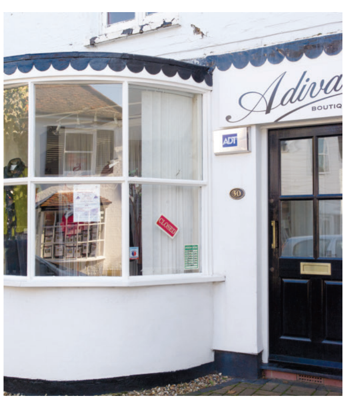
protection for this attractive shop would be lost

development" – a plan described by Conservative Waverley Council as a "developers' charter". Joining these august bodies, we opposed the draft document replacing the present system which has grown up over 50 years and which through its planning policy guidelines provides clarity and checks and balances to planning development.