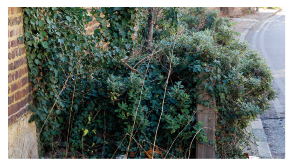
several derelict planters in the High Street

and planting in Hersham and Cobham and street furniture in Walton and Claygate.